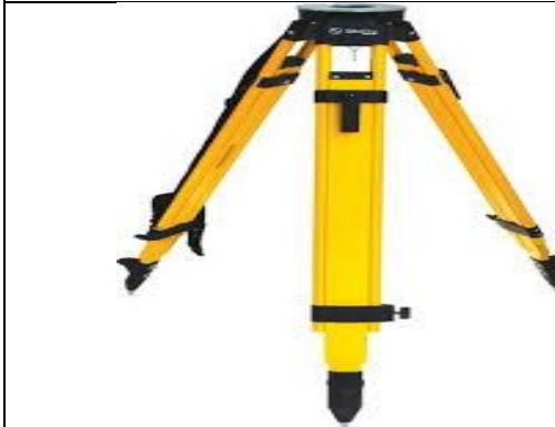
TOTAL STATION STAND