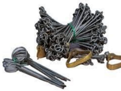
MEASURING SURVEY CHAIN