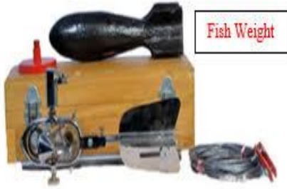
WATER CURRENT METER