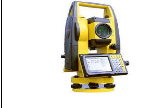
TOTAL STATION SOUTH