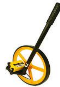
ROAD MEASURING WHEEL TYP