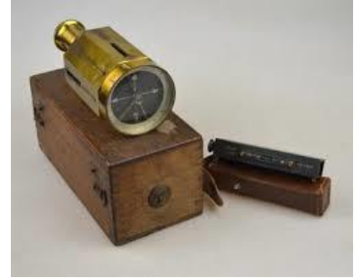
CROSS STAFF HEAD