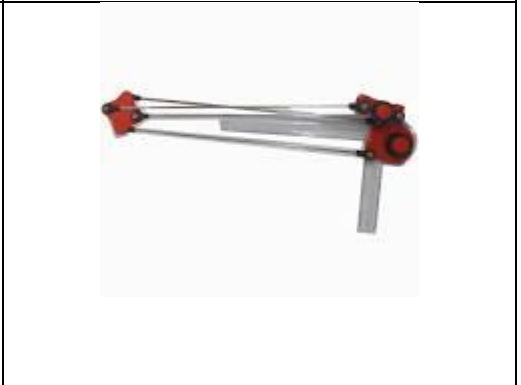
VERTICAL DRAFTING MACHINE/ MINI DRAFTER