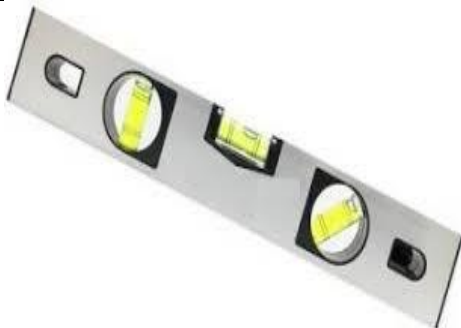
SPIRIT LEVEL/ HAND LEVEL