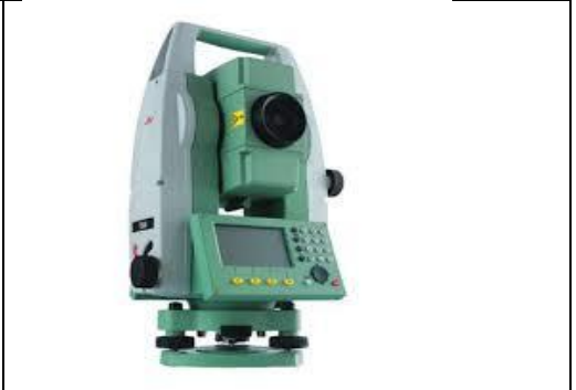
TOTAL STATION LEICA