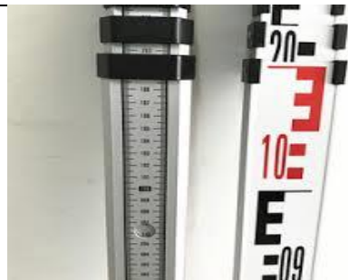
LEVELING STAFF ALUMINUM