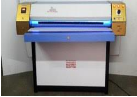
AMMONIA PRINTING MACHIN