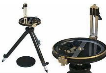
Prismatic Compass with Stand