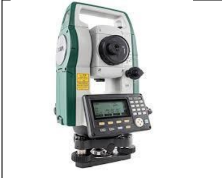
TOTAL STATION SOKKIA