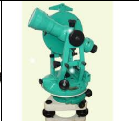
VERNIER TRANSIT THEODOLITE "ERECT IMAGE"